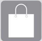
Mobile Point of Sale