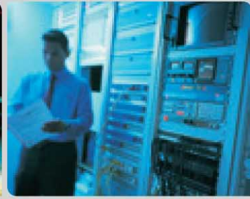
Field Force Automation