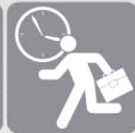
Work Order Tracking