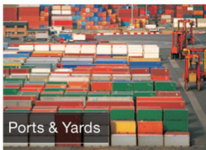
Ports & Yards