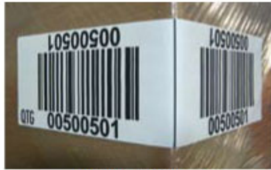
LPN/Pallet ID Label