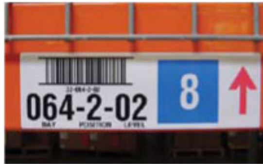
Rack/Bin Location Labels

We partner with the industry leader in variable information, sequential number and barcode label applications. In addition, we have a broad range of capabilities including custom blank labels, specialty materials, and harsh environment applications. Please see our website for more details.