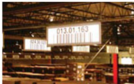
Warehouse Sign Installation

We utilize automated application equipment to apply barcode labels cost effectively. Retro-reflective material provides scan distances up to 50 feet, and polyester labels provide a cost-effective solution for short range scanning environments. We will engineer a label that will fit your existing scanning needs!